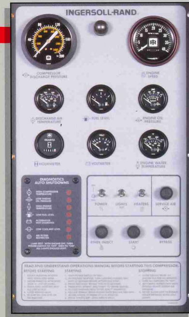
Full Gauge Package